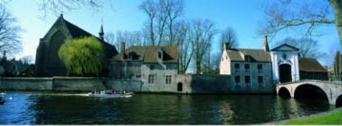
Toerisme Brugge foto Daniël de Kievith