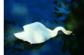
Toerisme Brugge foto Bruno Gouwy