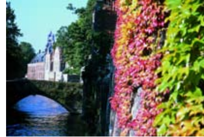
Toerisme Brugge