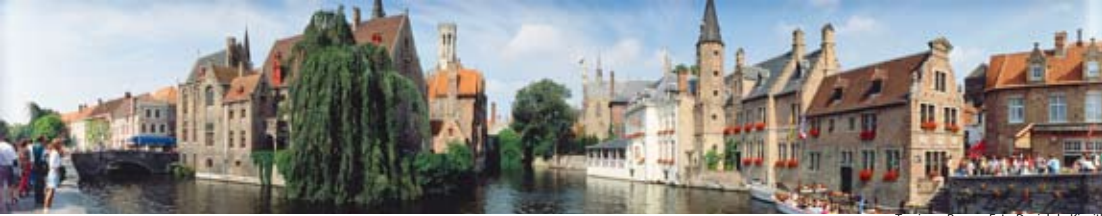
Toerisme Brugge Foto Daniel de Kievith