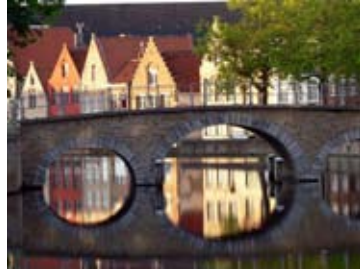
Toerisme Brugge www.weathercam.be