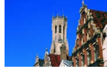
Toerisme Brugge