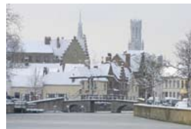
Cel fotografie Stad Brugge