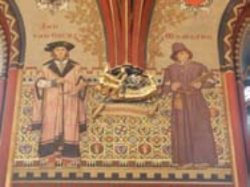
Toerisme Brugge Cel fotografie