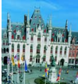
Toerisme Brugge foto Daniël de Kievith