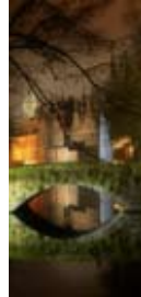
Toerisme Brugge